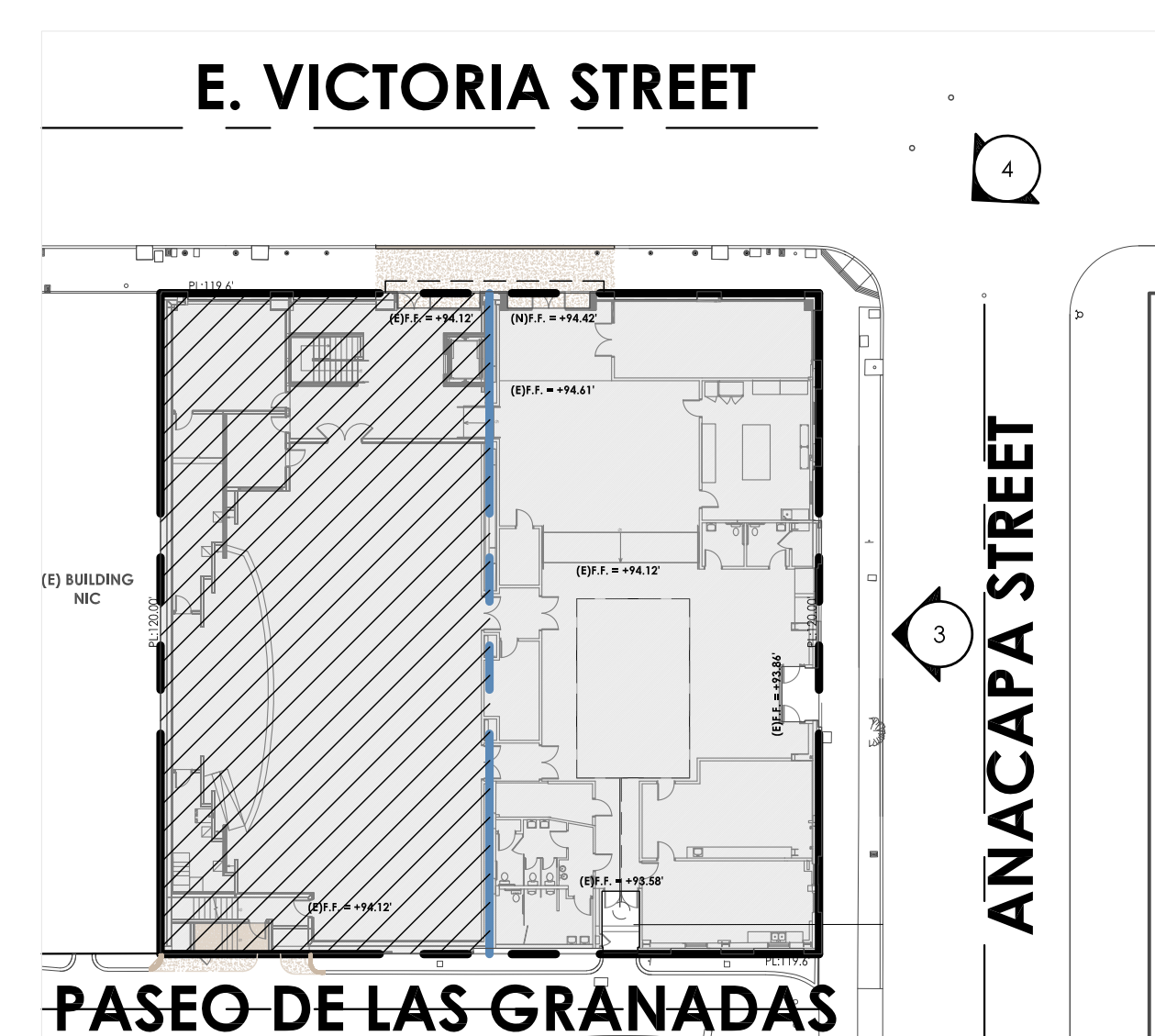
KEY PLAN - SITE