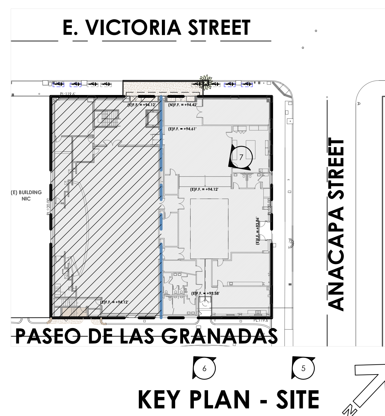
KEY PLAN - SITE