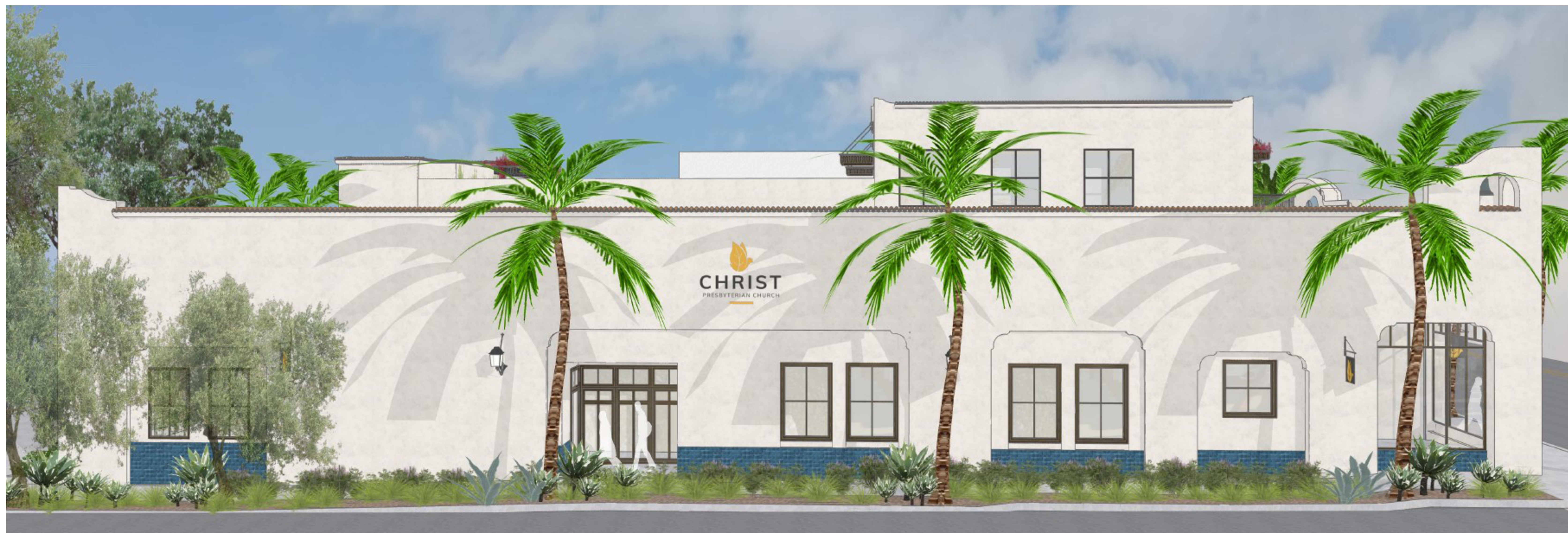
SIDE ELEVATION - EAST ANACAPA STREET