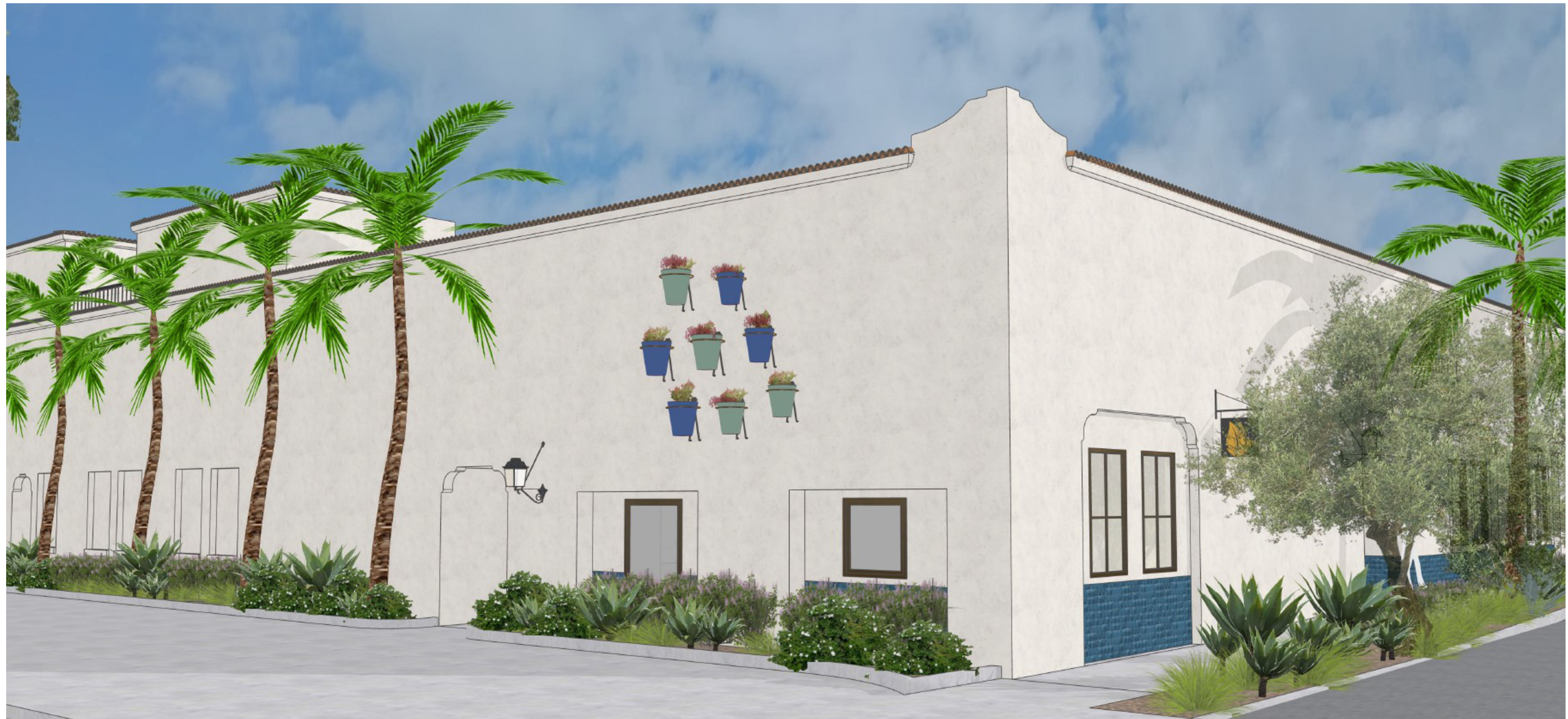
REAR VIEW - SOUTH PASEO DE LAS GRANADAS