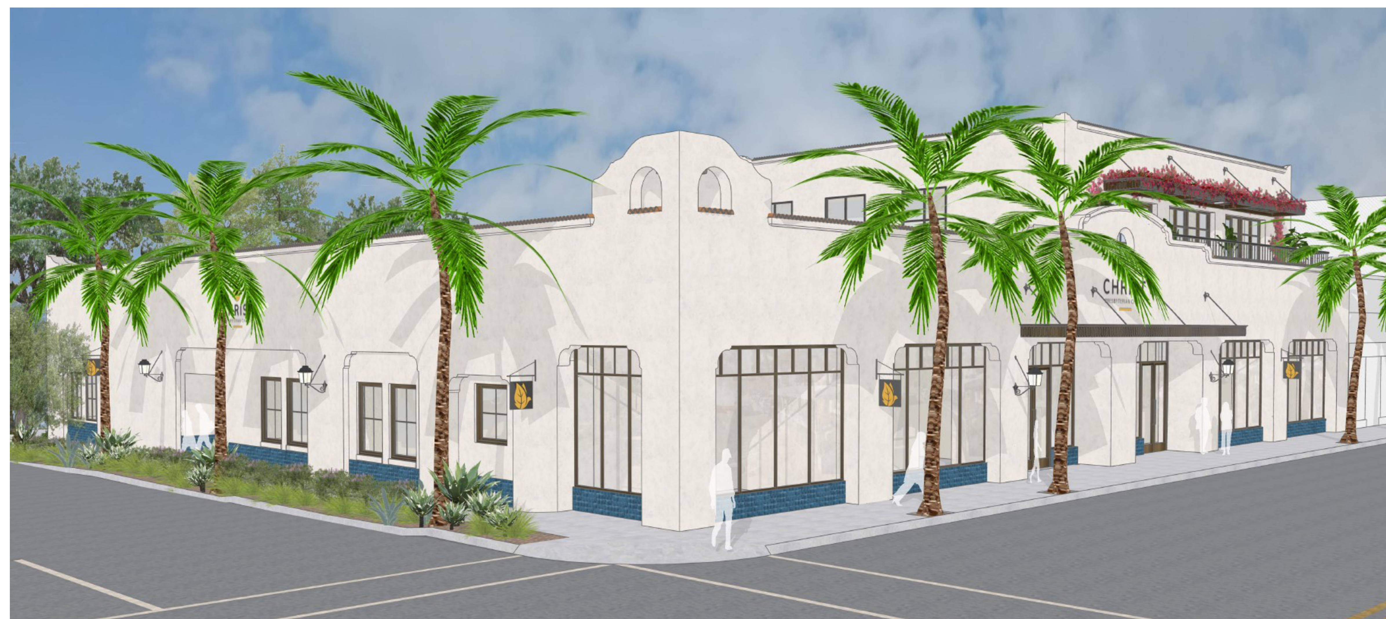
CORNER VIEW - NORTH/EAST