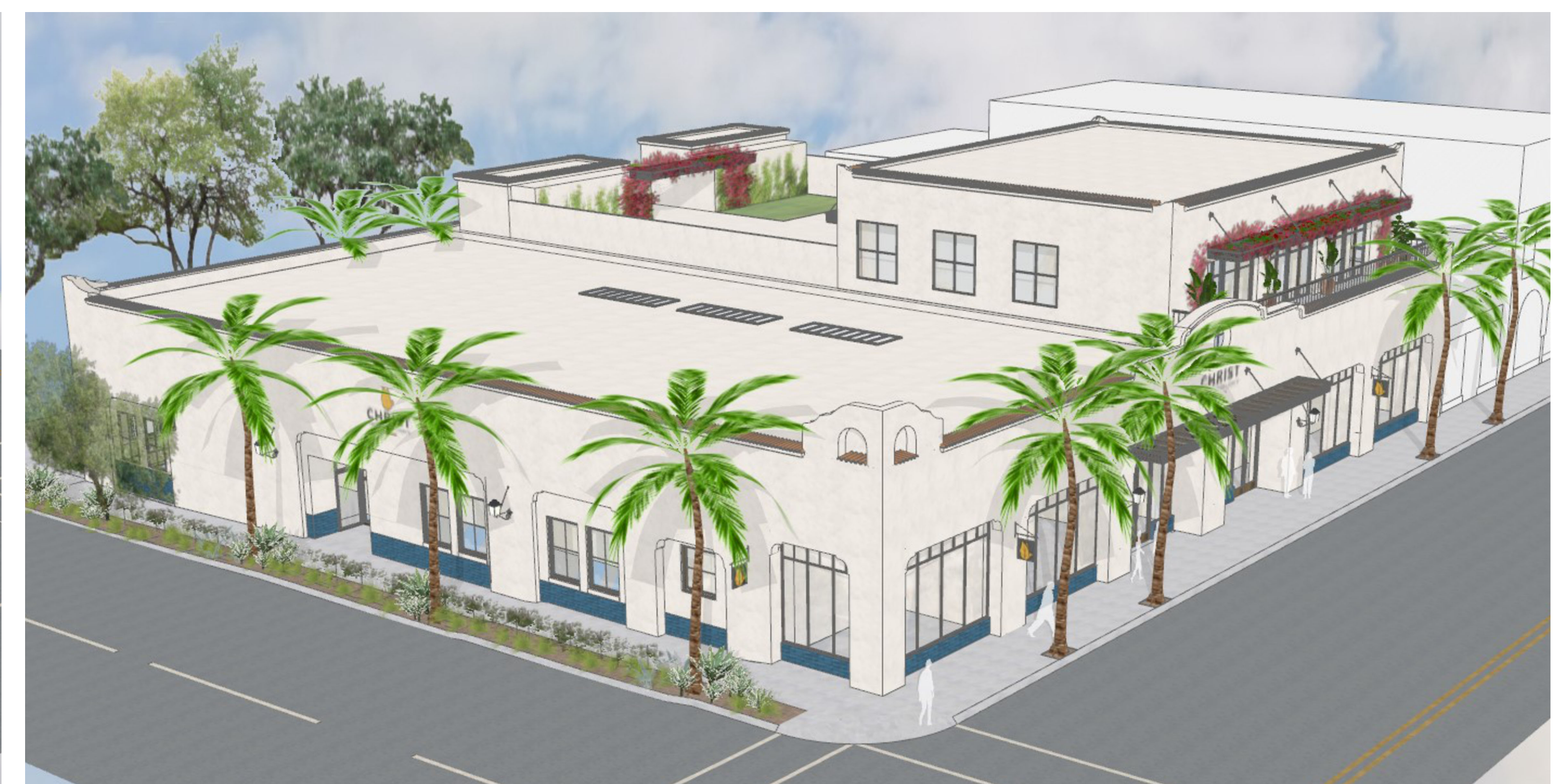
BIRD'S EYE ALONG VICTORIA ST AND ANACAPA ST. (