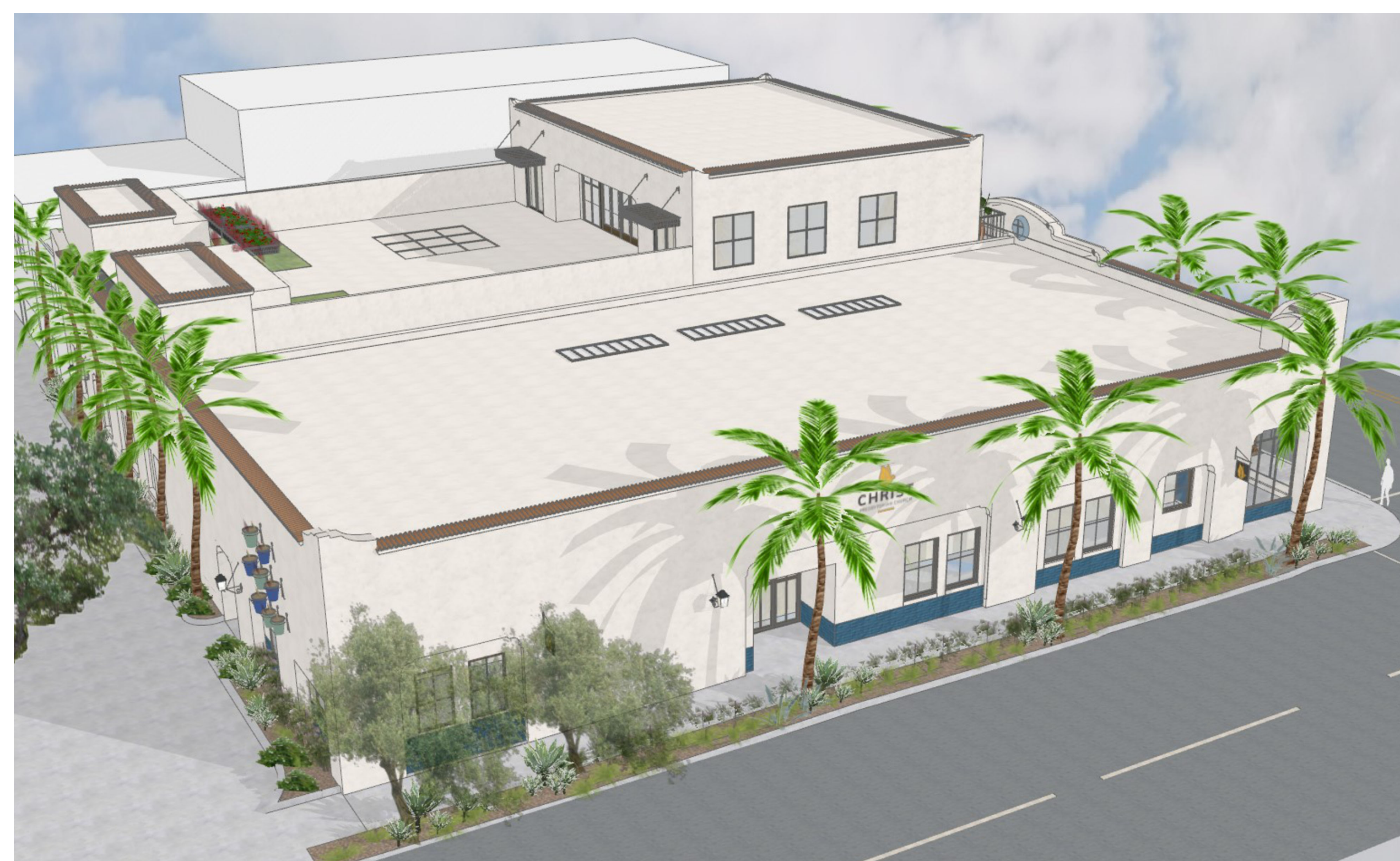
BIRD'S EYE ALONG PASEO DE LAS GRANADAS